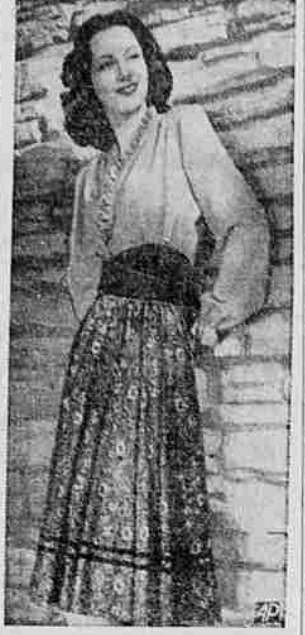
DIRNDL — Virginia O'Brien of the movies wears a cotton print challis dirndl skirt in red, white and blue, with a wide girdle and narrow bands of black velvet at the hem line.

CHICAGO, June 4 (AP-USDA) Potatoes, arrivals 57; on track 120; total US shipments 1114; supplies light; demand good; market slightly stronger; offerings very light account of track sales; California Long Whites 100 lbs, sack US No. 1, $4.25-30; commercials $3.88-4.10; US No. 2, $3.58-75; Alabama Bliss Triumphs US No. 1, $3.90; Louisiana Bliss Triumphs victory grade $3.85. Thirty different airplane models are produced for Great Britain by American factories.