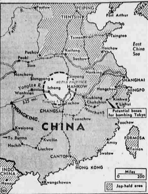
The long-fought war in China flares into new life as Jap forces press westward along the Yangtze river toward Chungking, seat of the Chinese government. Circled area shows current battle arena.