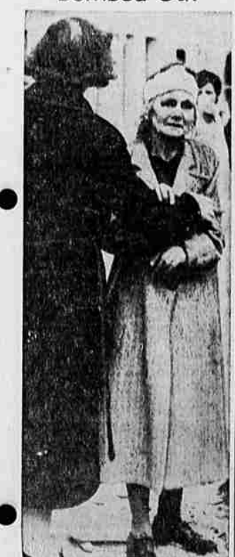
Bombings are bitter, as face of this London woman shows. Neighbors aid her at scene of her bomb-wrecked home.