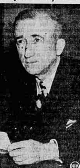
Judge Fred M. Vinson, above, of Kentucky, now a member of the U. S. Circuit Court of Appeals, has been named to succeed James P. Byrnes as the nation's economic stabilization director. President Roosevelt has appointed Byrnes to head a new super war mobilization office.