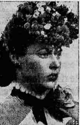
1885-1943—This 19th century bonnet, worn by Ingrid Bergman, borrows a strictly up-to-the-minute "victory garden" motif with its decorations of fruit, flowers and vegetable leaves. Looks good enough to eat, doesn't it?