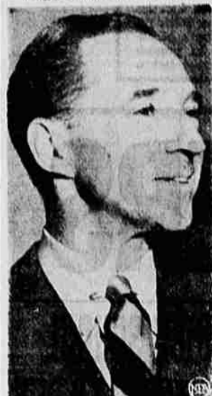
Edsel Bryant Ford, above, son of "The Little" king Henry Ford, and president of the Ford Motor Co., succumbed to a stomach ailment at his Detroit home on May 26. Ford, who was 49, is survived by his wife and four children.