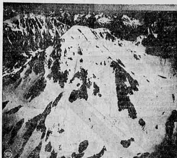
Beautiful but treacherous are the mountains of Attu where Americans are attacking Japs. Since sides of these volcanic peaks are too difficult to scale, our forces presumably advanced through passages between them. Enemy snipers hid in these hills to attack U. S. troops.