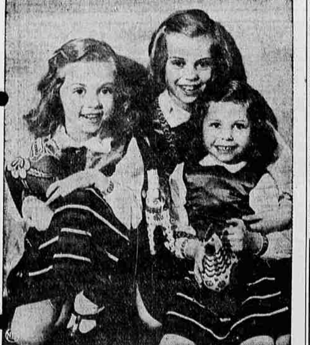
Although their country is an island of neutrality in a continent of war, these three little Swedish princesses have gay smiles for the camera at their home near Stockholm. They are Princesses Birgit, 6; Margaretha, 9, and Desiree, 5, daughters of Prince Gustaf Adolf and great granddaughters of King Gustav V.