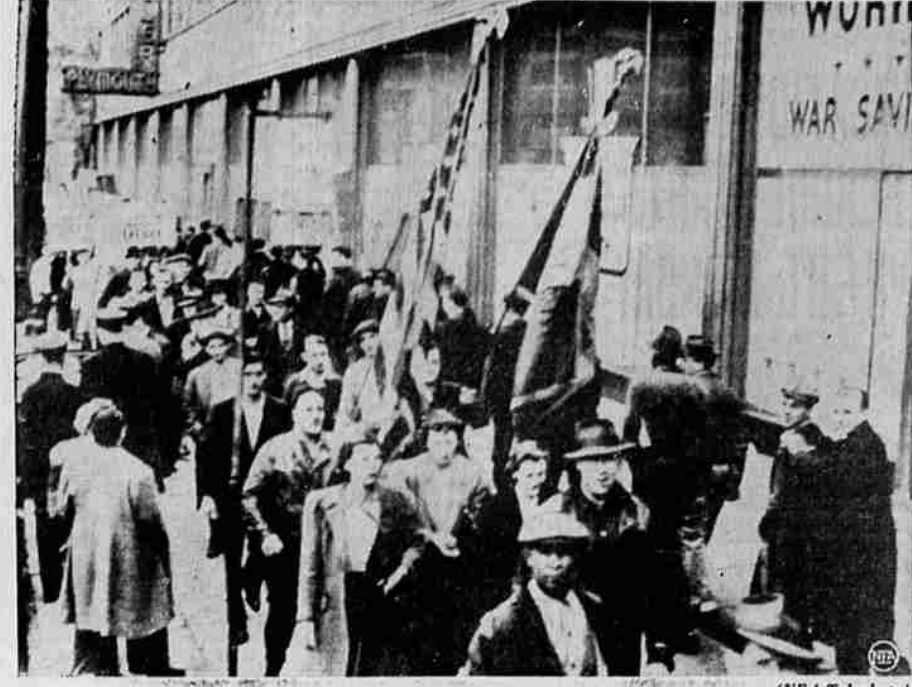
Twenty-four thousand CIO workers have already stopped working at three of the large Chrysler war factories in Michigan and company officials feared a walk out of 85,000 workers in a wave of strikes during a contract dispute. Pictured here are pickets crowding a sidewalk in front of one of the arms-producing plants.