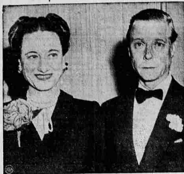
Visitors in New York again are the ever-attractive Duchess of Windsor and the Duke, whose face begins to betray his years.