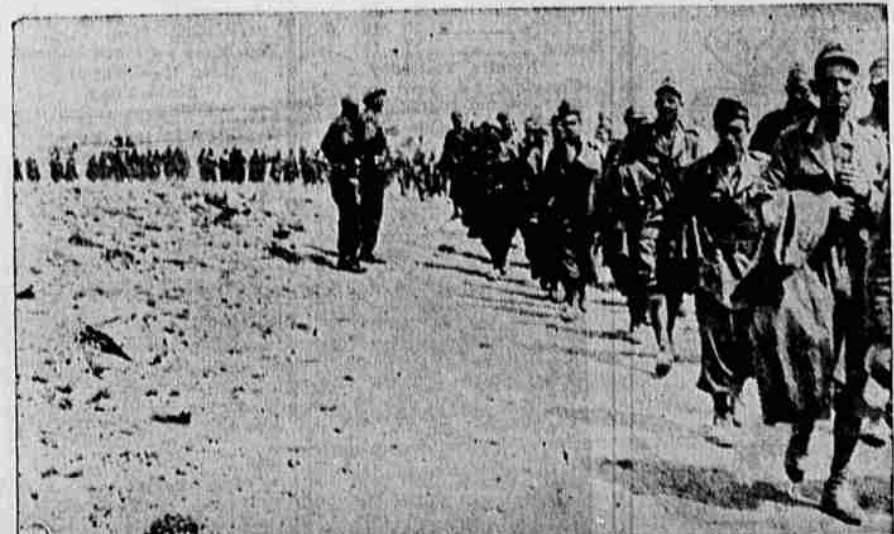
As the British on Cape Bon, and the American and French forces in other sectors in Tunisia, continued their unrelenting attacks, more and more Axis soldiers joined the line of prisoners totaling tens of thousands. Here a steady file, mostly Italians, march under the watchful eyes of two British Tommies.