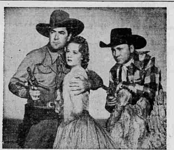
Scene from "Cheyenne Roundup," starring Johnny Mack Brown, with Tex Ritter and Fuzzy Knight in a tale of the romantic old West, which has its first Klamath showing at the Tower Sunday. The companion feature stars Mickey Rooney as "A Yank in Eton."