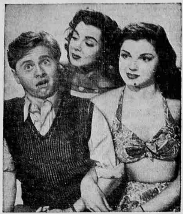
Andy Hardy, alias Mickey Rooney, learns the meaning of the old maxim, when he finds a new sweetheart, beautiful swimming champion Esther Williams, and still finds himself attached to his "steady," Ann Rutherford, in M-G-M's "Andy Hardy's Double Life," starting tomorrow at the Esquire theatre.