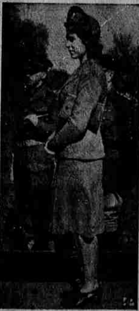
COLONEL —Princess Elizabeth of England, colonel of the Grenadier Guards, wears the regimental badge on her hat as she reviews an armored battalion of her regiment.