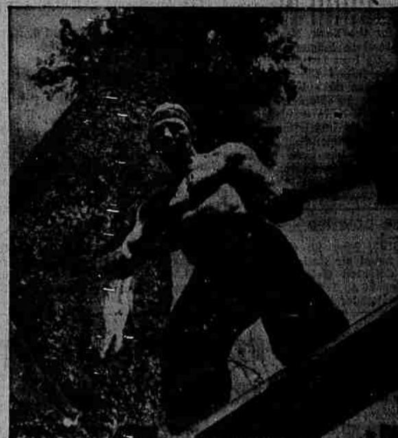
HUSKY 'FALLER' —Ollie Brackoos, Canadian lumberjack, weighs only 150 pounds but swings an axe with mighty muscles gained through 11 years' experience as a "faller"—the man who chops through trees at the base.