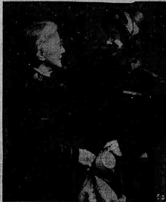
HOME FROM PRISON CAMPS —Col. Mary Booth (right), granddaughter of the founder of the Salvation Army, is greeted by her mother, Commander Mrs. Bramwell Booth, upon her return to England from months in German prison camps.