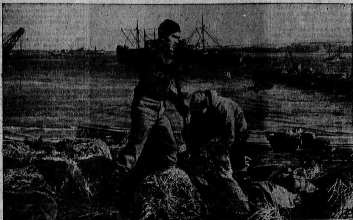
BUILDING NEW WESTERN ALEUTIAN BASE —With the busy harbor in the background, two members of American forces which landed on Agassiz Island in the Aleutians are hard at work. New advance base makes bombing Jap invaders easier.