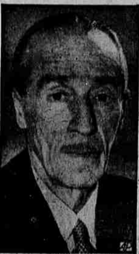
ENVOY —The Duke of Alba (above), Spanish ambassador to Great Britain, recently returned to his post in London after a holiday during which time he visited Switzerland.