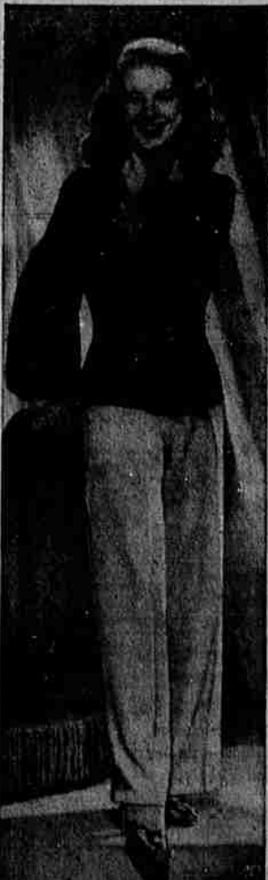
SUB-DEB —Virginia Weldler of the movies models smart lounging pajamas—slim slacks of beige crepe, with side-buttoning green tunic.