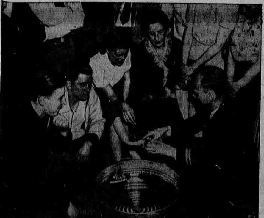
WARSHIPS IN WASHTUB —With the aid of ship models, Lieut. William Clay Moore, naval inspector, demonstrates to war workers of the Package Machinery Co., Springfield, Mass., just how the gyro-compass devices they turn out are used on small navy craft. The plant recently finished re-tooling for conversion to gyro-compass production.