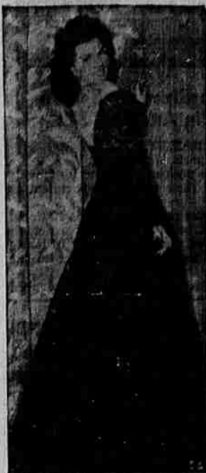
TULLE —Black tulle over pink net forms the full skirt of this evening gown worn by Ann Miller, screen actress. Molded bodice and long sleeves are fashionable touches.