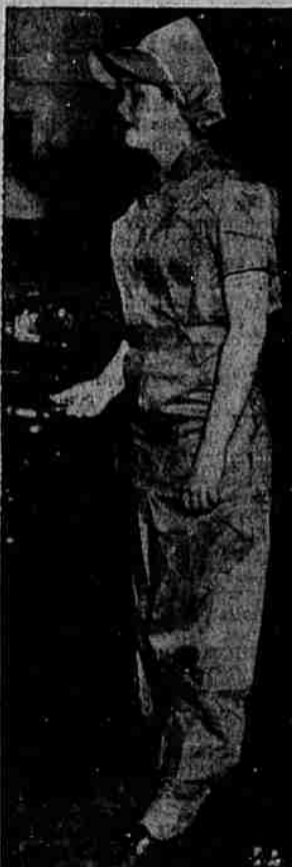
COVERALLS —Nancy Gates, movie starlet, wears the safety outfit for war workers designed by the NYA from labor department specifications.