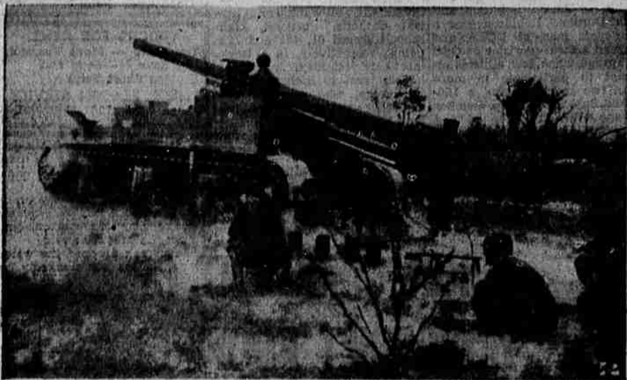
ARMY M-12 IN ACTION —A 155 mm. gun, mounted on the new U. S. Army M-12 motor carriage, is fired at Aberdeen, Md. The M-12 does 39 m.p.h. over rough terrain.