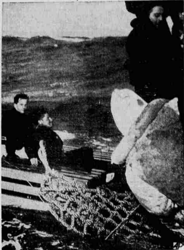
Clinging desperately to their raft in a tipping sea, two survivors of a British merchant ship torpedoed in the Atlantic wait their turn to be taken aboard the U. S. coast guard which found them.