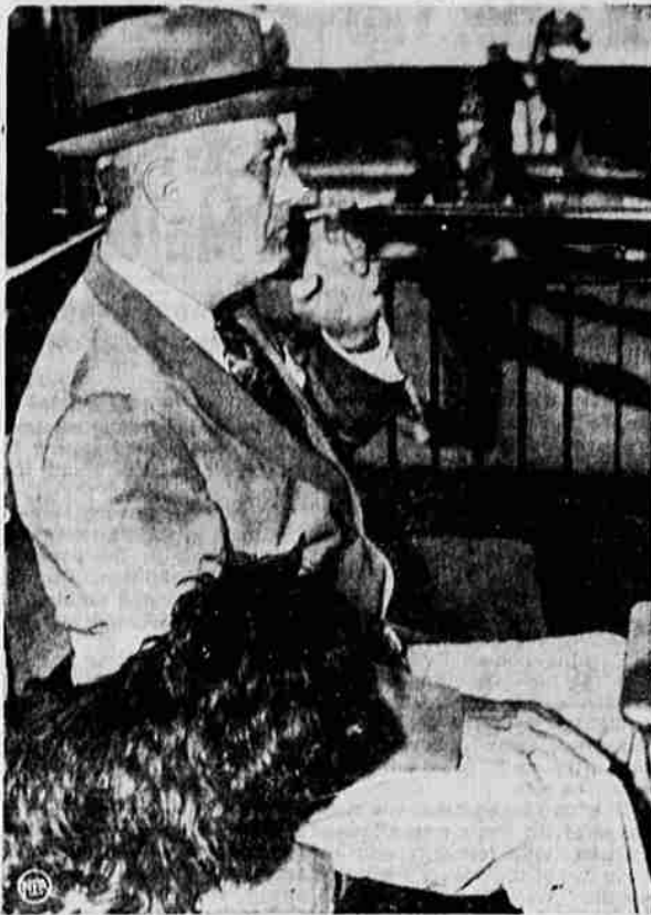
While on a tour of military bases throughout the country, President Roosevelt and the ever-present scotty, Falla, stopped at Ft. Riley, Kas., and were greeted with a concert given by the men of the post. Here they sit on the rear platform of the President's train and enjoy the music.