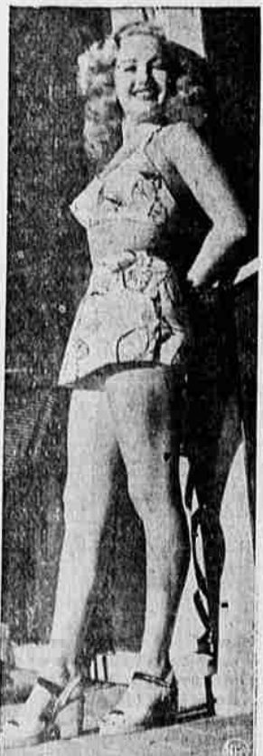
Betty Grable's swim suit proves even the current clothes conservation trend is not without its attractions.