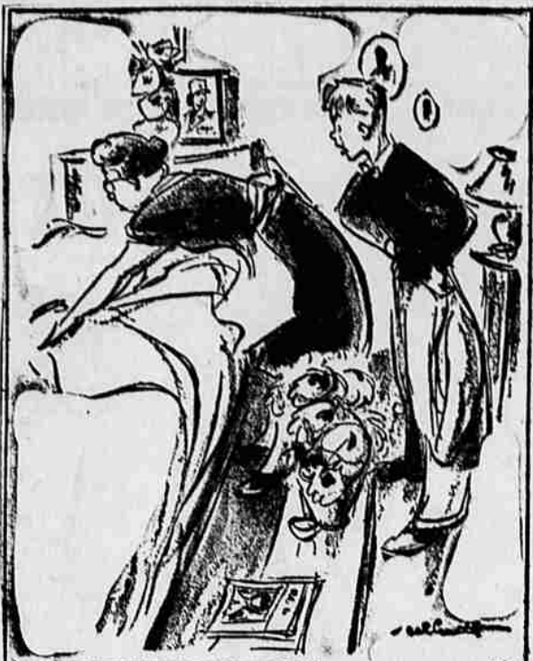
Yes, but I'm almost old enough to enlist in the Marines! I feel like Benedict Arnold when everybody asks how my sister doing in the WAAGS!