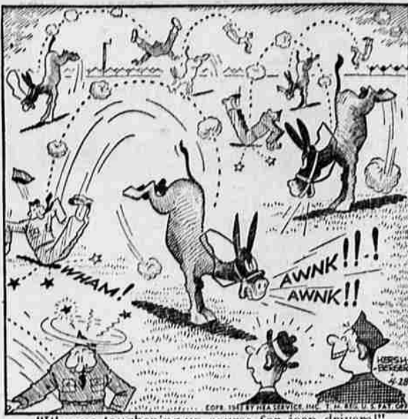
"It's our toughening-up course for jeep drivers!"