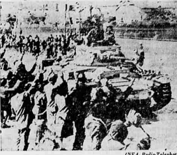
Crowds cheer the tank-led British Eighth Army entering Sfax, Tunisia, after it routed the Axis forces in North Africa.

Cars Ransacked —Cars were ransacked at Sixth and Klamath during evening hours, according to a report filed with city police by H. R. Skinner, service station operator.