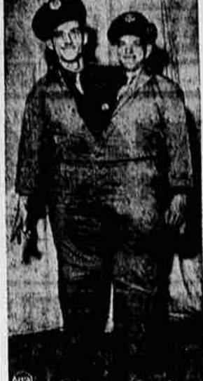
Instead of the two-pants suit, we have here the two-men pants, as worn by a pair of air transport command privates at Long Beach, Calif., who climbed into their 260-pound sergeant's coveralls.