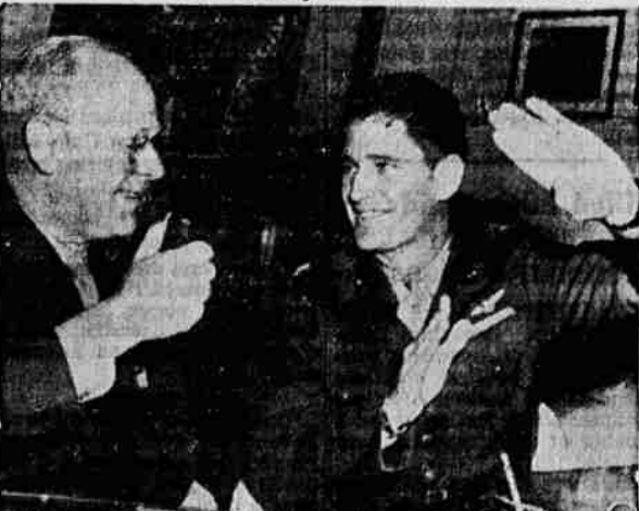
Captain Joe Foss of the Marine Corps returned to United States after having downed 26, and possibly a half dozen more, Jap planes in the South Pacific. At his first press conference upon returning to the States, America's No. 1 ace of the war declared that he was ready to tackle the Germans if assigned to that job. Foss, right, describes a maneuver to Lieut. Gen. Thomas Holcomb, Marine commandant.