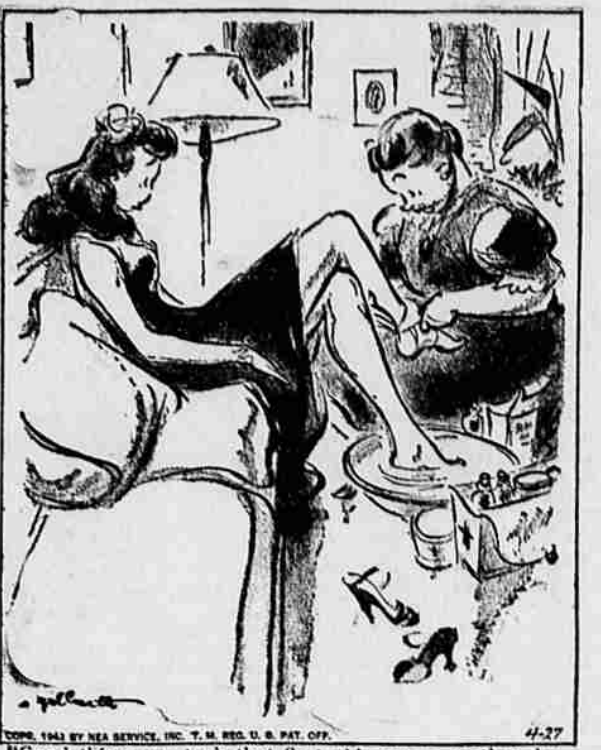
Good thing you took that first aid course, mother, before I started going to the U. S. O. dances!