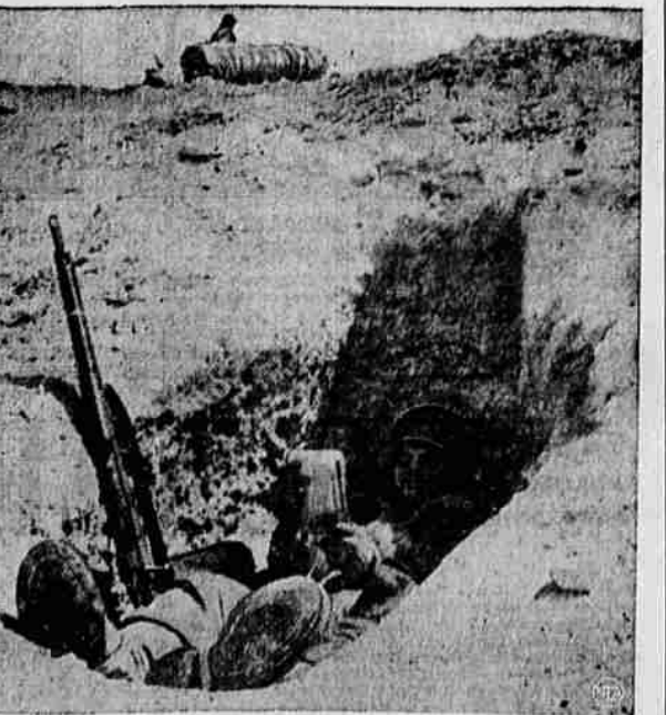
In the slight shade of a slit trench in North Africa Pvt. Ernest G. Thompson of Sharpsburg, Ky., curls up with a good book. Trench protects him both from bombing and desert sun.