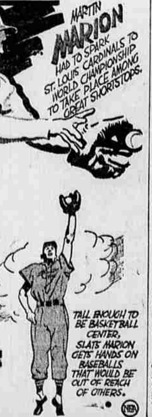
MARTIN MARION HAD TO SPARK ST. LOUIS CARDINALS TO WORLD CHAMPIONSHIP TO TAKE PLACE AMONG GREAT SHORTSTOPS.