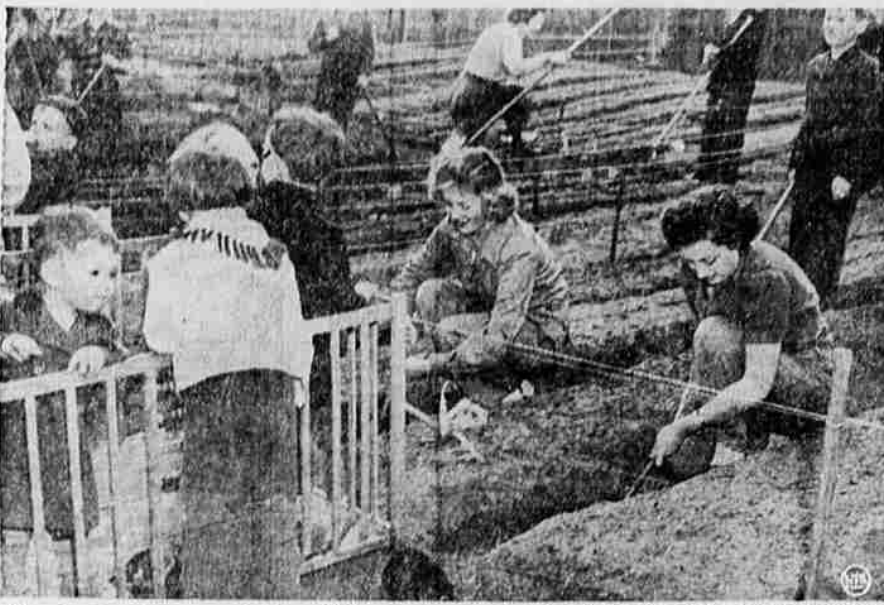
These San Francisco women don't use children as an excuse for being absent from work on their community victory garden. The mothers simply bring children and play pens to the garden, park them close to the plots being worked and go on about their business of growing vegetables.