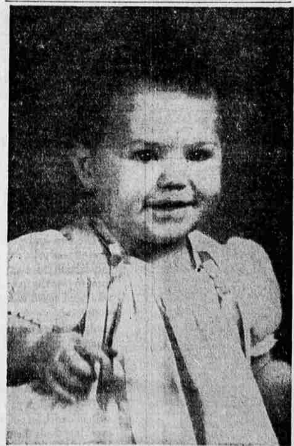
SEE ANY BUNNIES?

Currin's for Drugs KLAMATH'S DRUG and COSMETIC CENTER 9th and Main Dial. 4514