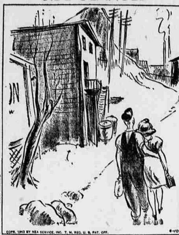
8-70