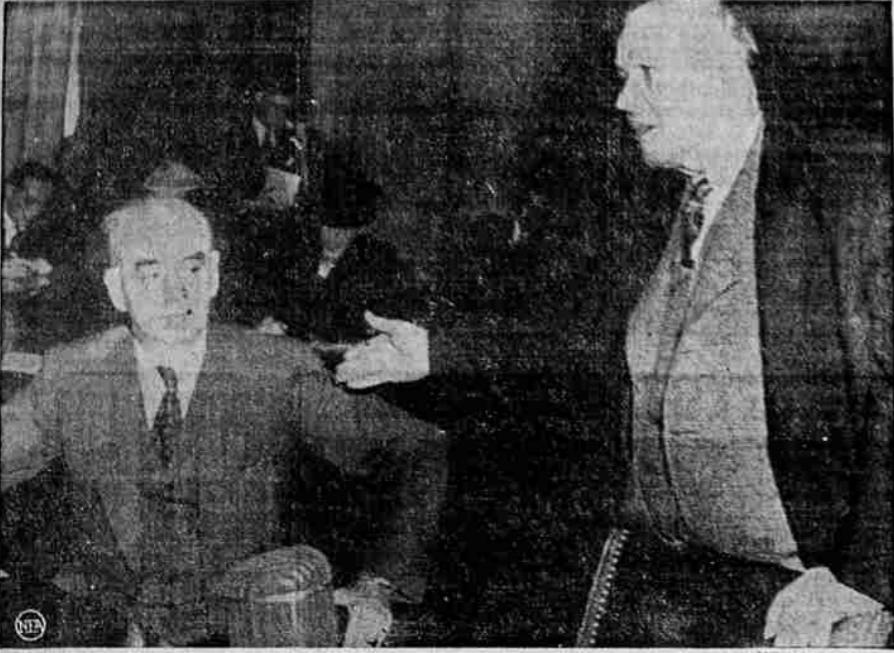
William Green, right, AFL president, has his say during a heated discussion with CIO head Philip Murray, left, at the hearing before the Senate Truman Committee...