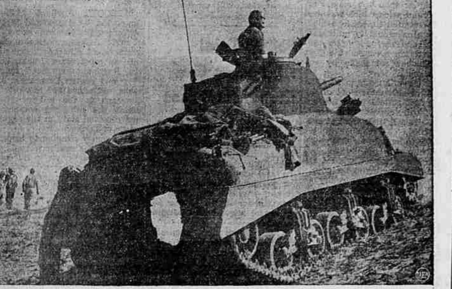
American M-4 medium tank stands ready to go into action on the Tunisian front now under command of Gen. George Patton. Note censor's blot at rear of tank.