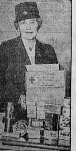
One of the many Red Cross activities is providing aid for prisoners of war. Typical package sent to American prisoners of the axis includes powdered milk, cheese, margarine, meat, fish, prunes, sugar, coffee, chocolate and cizarets.