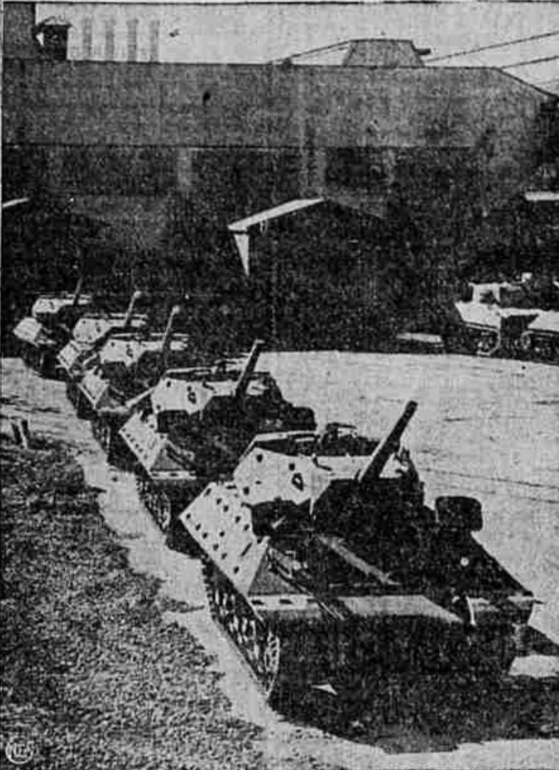
Out of the factory and onto the battle line roll U. S. M-10 tank destroyers in this picture symbolic of our rapid war production. It was taken at a Detroit Ford plant.