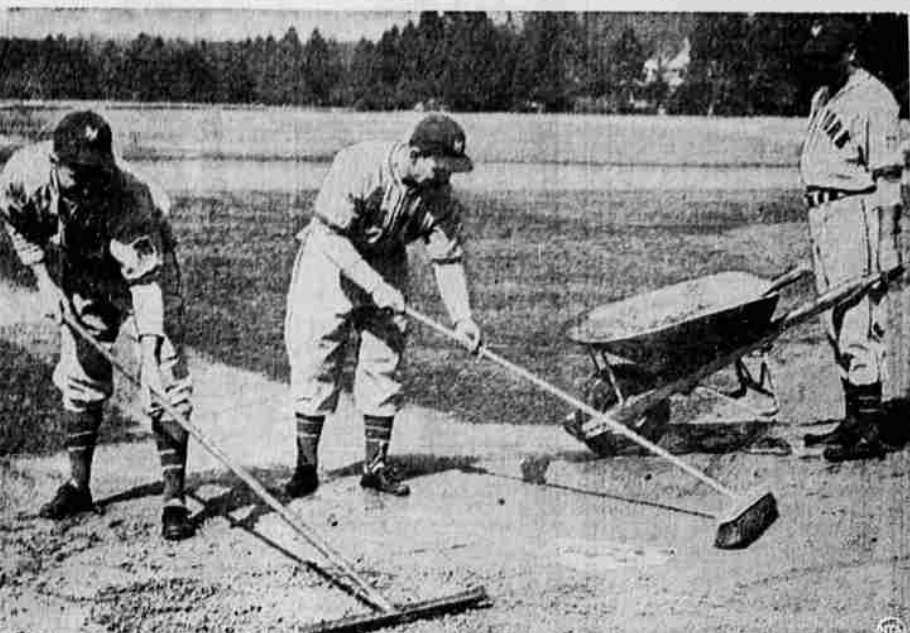
Bill Jurges, left; Manager Mel Ott, center; and Babe Barna are clean-up men as New York Giants start spring training outdoors at Lakewood, N. J.