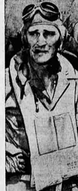
You've gotta be tough to keep up a daily routine of fighting taps in South Pacific skies, and Capt. Joe Foss, Marine ace who downed 26 planes, looks it.