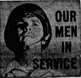
OUR MEN IN SERVICE

If you want to sell it—phones The Herald and News "want ads," 3124.