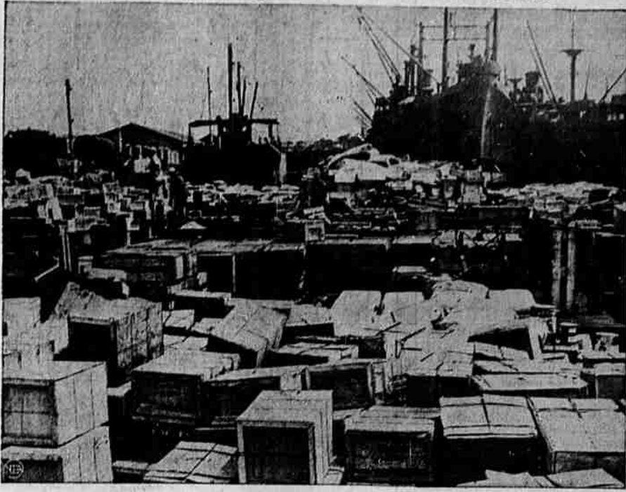
You may recognize in this picture some of the food you haven't been seeing on grocery shelves of late. It's a typical dock scene in New Caledonia from where food is distributed to U. S. fighters in South Pacific.