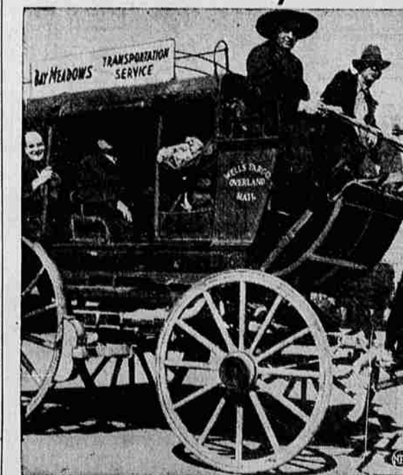
Reviving memories of '48ers, this old Wells Fargo overland mail coach will haul horse players to Bay Meadows, down peninsula from San Francisco. Difference is they are not caught in gold rush.