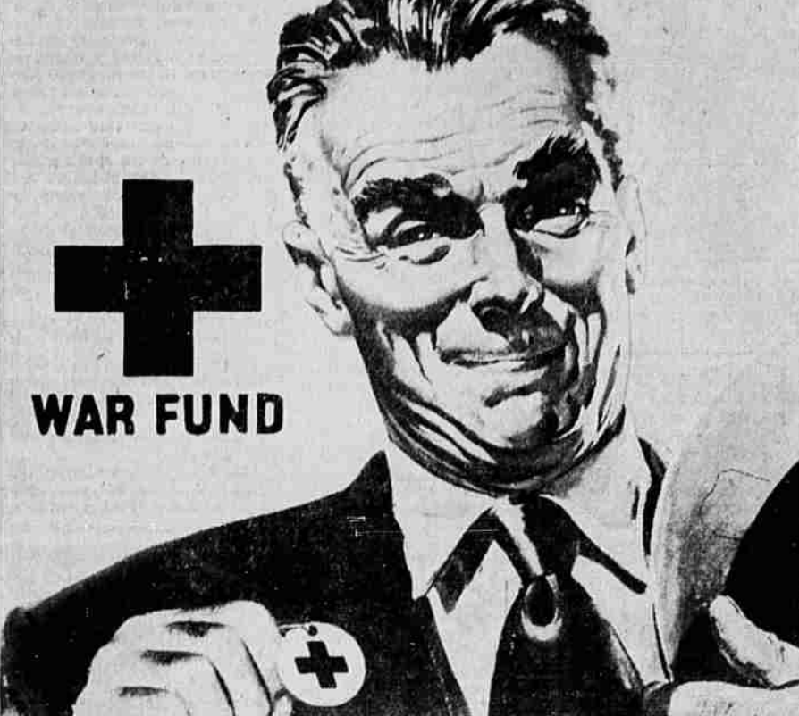
Indicative of the spirit with which Americans will respond to the 1943 Red Cross War Fund appeal is this poster by Wendell Kling, noted illustrator. The cheerful individual pictured is proudly displaying the new Red Cross lapel tag, made from paper to help conserve metal for the war effort.