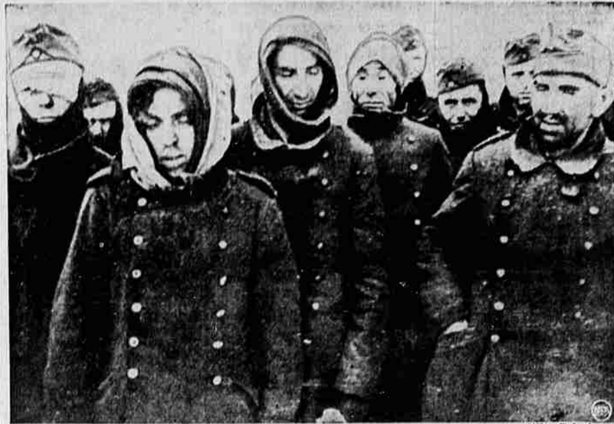
This is probably as sorry a bunch of war prisoners as you've run across. They are a few of the thousands of German prisoners taken by the Russian Army in recent sweeping gains that are driving the vaunted Nazi "super-men" from Red territory.