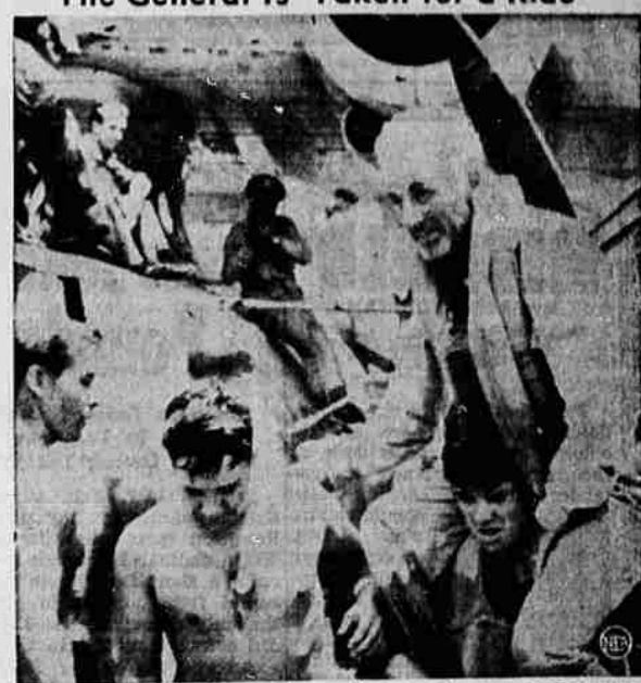
The best ride he ever had is this one taken by Brig. Gen. N. F. Twining, right, on the shoulders of a crewman of the PBV flying boat, back-ground, which rescued the general and 14 others after they had been forced down in the Coral Sea recently and spent six days and five nights adrift in life rafts. They are shown after the rescue plane returned all hands safely to an unidentified Pacific base.