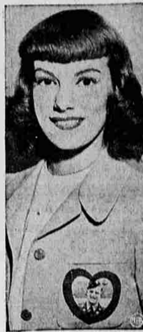
The soldier over Faye Emerson's heart is the man in her heart. It's the Hollywood way of wearing valentines.