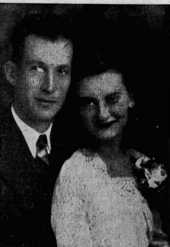
NOW AT HOME