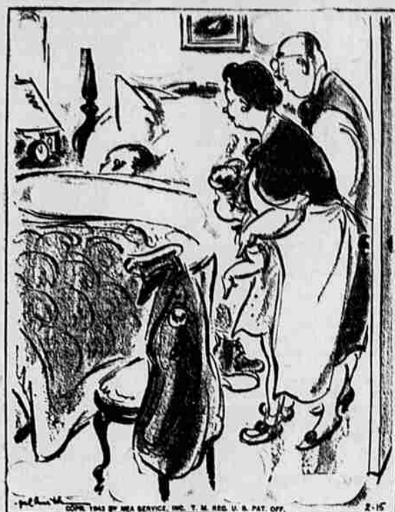
"It's wonderful having him home on furlough, even if he is so busy gadding about we only get a good look at him when he's in bed!"