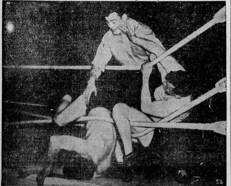
Even the referee gets a push in the face as two marine wrestlers tangle themselves in the ropes during a match in the post gymnasium at Quantico, Va.