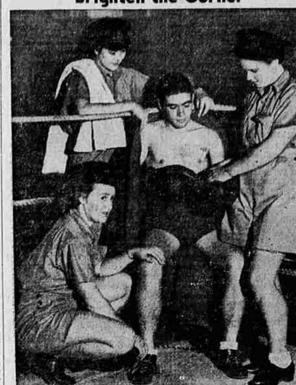
Fair auxiliaries second boxers in Royal Australian air force matches.