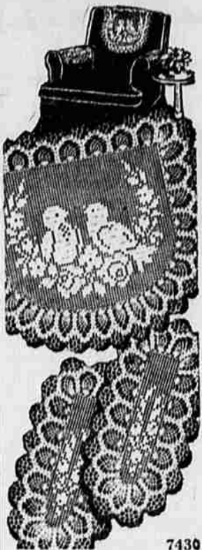
7430 by Alice Brooks

Turn old furniture into new with this really beautiful filet crocheted set for chair or couch. It gives a lacy, dressed-up note, and it also makes a fine "hide-away" for shabby spots. The attractive love-bird motif is easy to do; so is the graceful pineapple border. Pattern 7430 contains charts and instructions for set; stitches; materials needed.