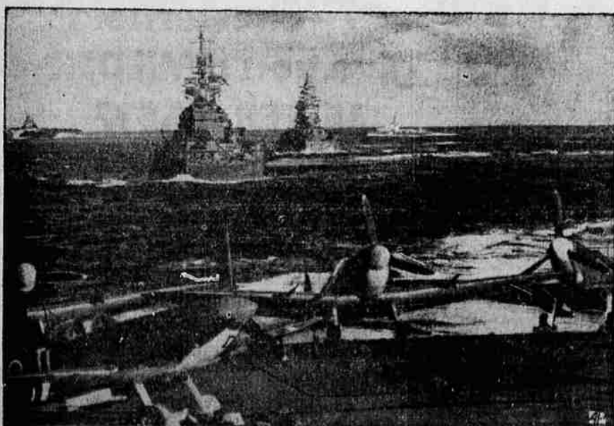
ROYAL NAVY OFF AFRICA —A big factor in making the Allied North African landings a success was the British Royal Navy. A covering force is shown here off the African coast.