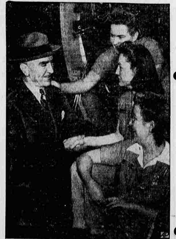
'RICK' GREET'S AIRPLANE WORKERS —During a tour of a Detroit bomber plant Capt. Eddie Rickenbacker stops to greet some women war workers. Eddie told of life on the war fronts and urged still greater effort on the home front.