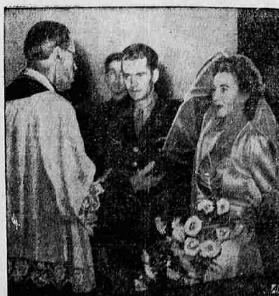
WEDS YANK IN ENGLAND —Actress Carole Landis stands beside Capt. Thomas Wallace at their London wedding.