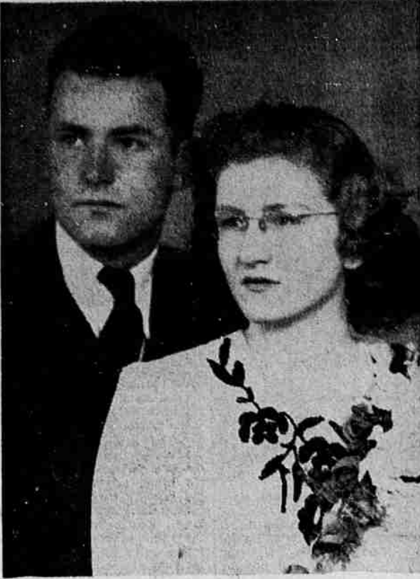
WED IN JANUARY