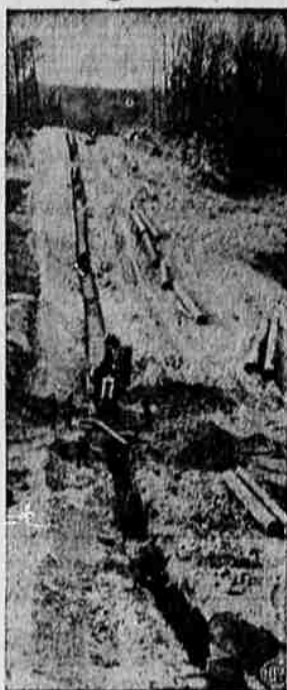
Over hill and dale through wooded Pennsylvania winds a section of the pipeline that will be carrying Texas petroleum to the oil-short east by June. The Texas-Illinois part of this world's largest pipeline—nicknamed "Big Inch"—is now near completion.