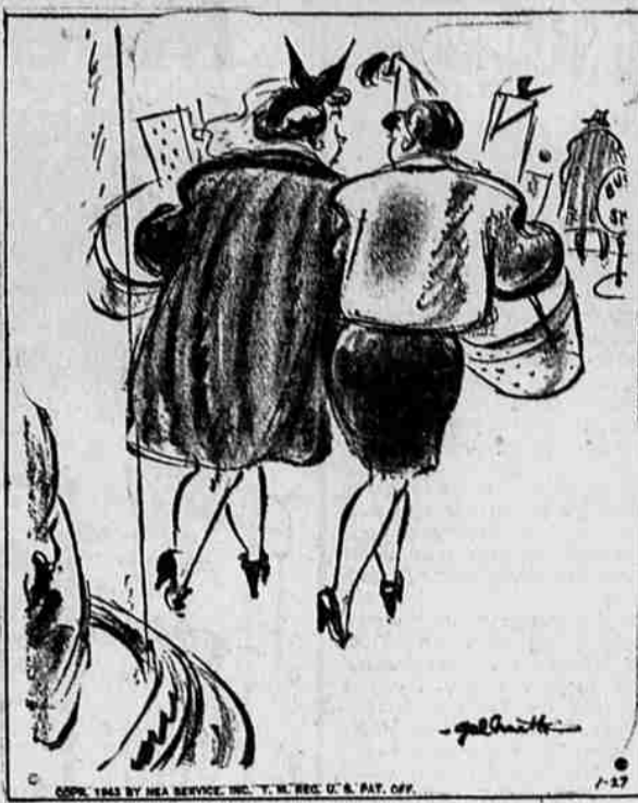
"Oh, I won't mind getting along on fewer clothes—it will give me something in common with our boys in the jungles!"