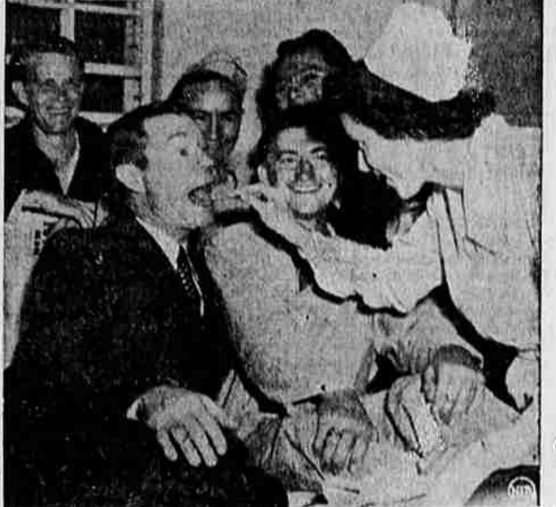
Movie comedian Joe E. Brown really gets around these days. He's shown, left foreground, in Honolulu's Tripler Hospital getting right chummy with the soldier patients.