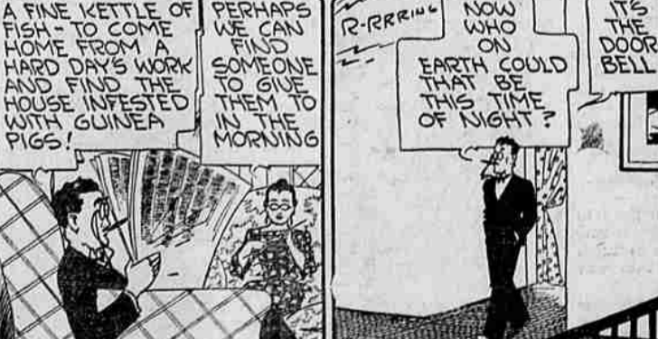
Boots and Her Buddies