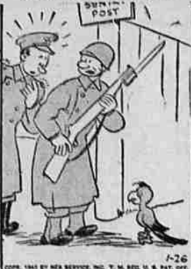
"What shall I do now, sir? It knows the password!"