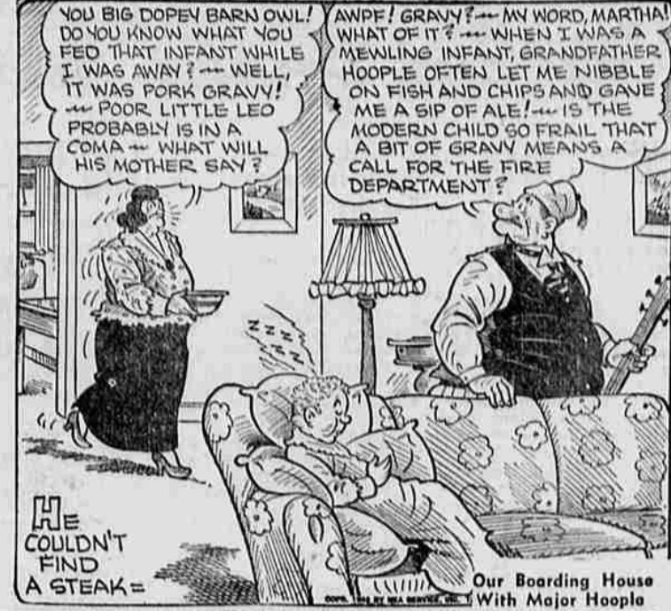
Our Boarding House With Major Hoople