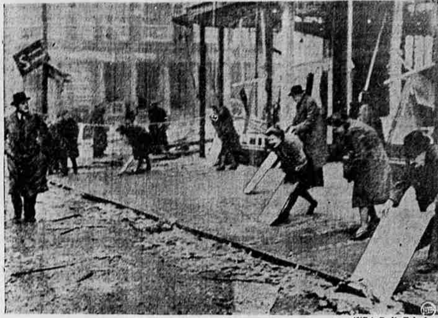
Girls join the men folks in scraping up shattered glass outside a London department store, which felt the effects of the feeble reprisal air raid of Jan. 17, which the Nazis sent against the British capital after Berlin was heavily bombed by the RAF. Photo radioed London-New York.