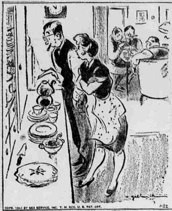
One more hand—that's always the way—and after that you probably won't have enough money left to buy our next pound of coffee!