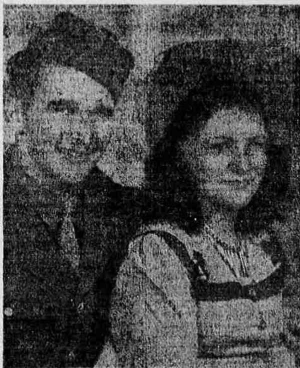
WED CHRISTMAS DAY