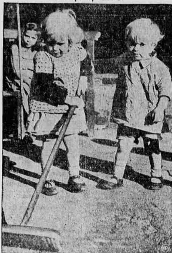
English tot busies herself with a broom while the man of the house fills the role of straw boss at a country settlement playground built on the site of a bombed house.