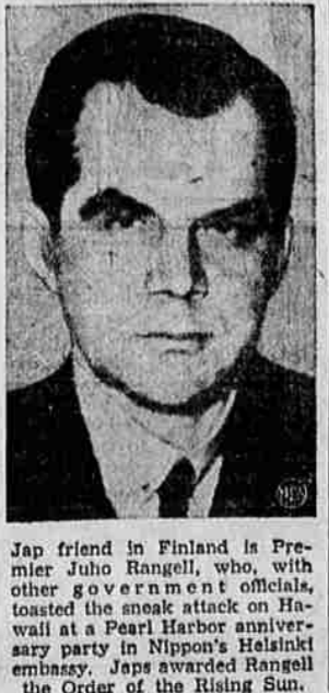
Jap friend in Finland is Premier Juho Rangell, who, with other government officials, toasted the sneak attack on Hawaii at a Pearl Harbor anniversary party in Nippon's Helsinki embassy. Japs awarded Rangell the Order of the Rising Sun.

Dealer shortages put new value on used merchandise. Cash in on your "junk" through a classified ad. Phone 3124.