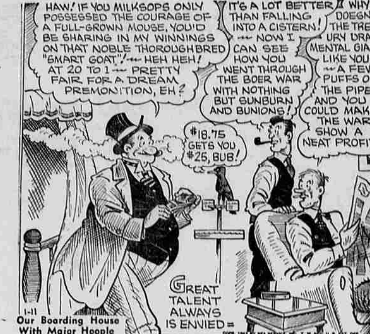
Our Boarding House With Major Hoople