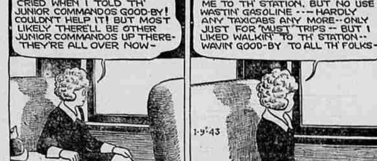
Lirrie Orphan Annie