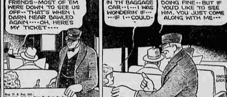
By Harold Gray