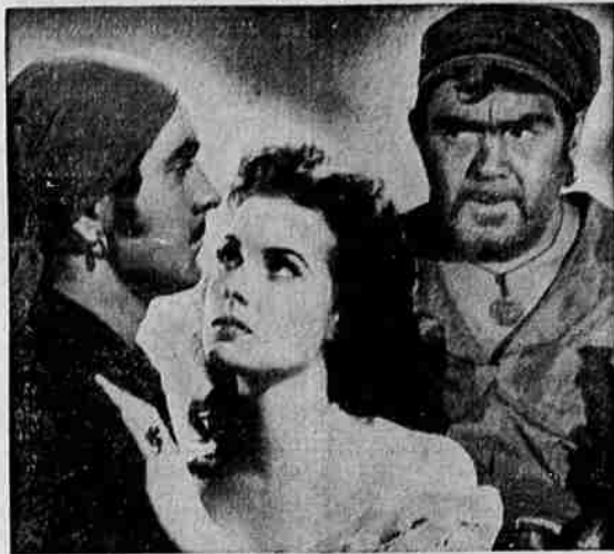
Skeptic Thomas Mitchell seems to be trying to break up the romance between Tyrone Power and Maureen O'Hara in this scene from Rafael Sabatini's "The Black Swan." The new technical hit at the Pelican theatre starting tonight at midnight. But rest easy, mates, for Tyrone does more than all right with the fiery red-head.