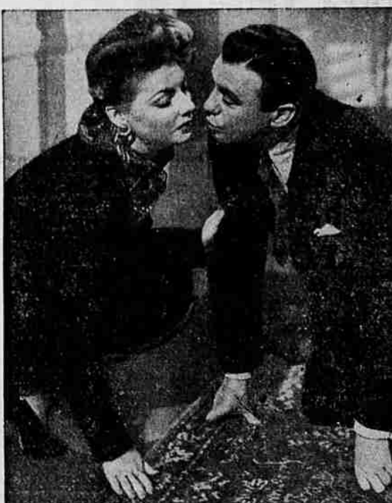
No, Ann Sheridan and Jack Benny are not getting ready to cut a rug. It's just one of their scenes from Warner Bros.' version of the famous stage comedy, "George Washington Slept Here," the current attraction at the Esquire.