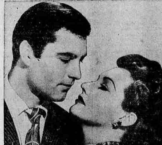
George Montgomery and Ann Rutherford carry the romantic leads in "Orchestra Wives," which features Glenn Miller and his band. Also in the cast are Carole Landis, Lynn Bari and Cesar Romero. "Orchestra Wives" heads the program at the Tower theatre starting Sunday.