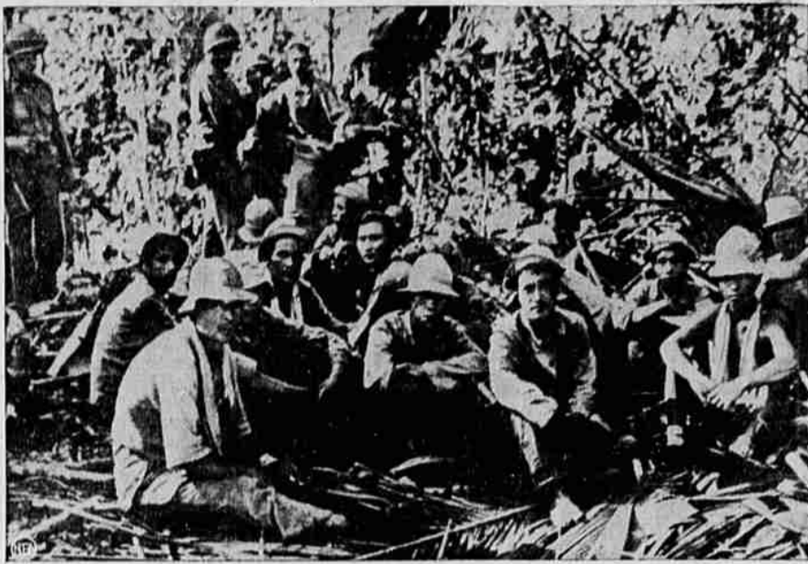
"Go climb a tree," was meant literally when the command was given Jap soldiers by their officers on Guadalcanal. U. S. Marine sharpshooters, however, brought the nimble climbers down even more rapidly than they went up. Note spit-toed tree climbing shoes on prisoners in foreground.