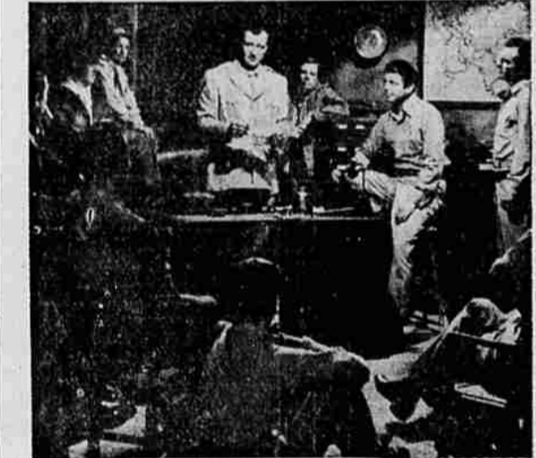
John Wayne gives last minute instructions to the men of his command for a raid on the Japs in the thrilling picture, "The Flying Tigers," starting tonight at midnight at the Pelican theatre.