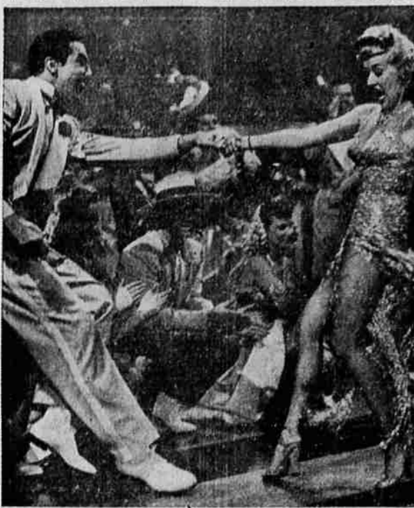
Betty Grable and Cesar Romero are shown above as they cut loose to Harry James' violent version of "Pan American Jubilee," one of a new batch of Mack Gordon-Harry Warren tunes in 20th Century-Fox's new technicolor frolic, "Springtime in the Rockies," now at the Esquire theatre. Starred, too, are John Payne and the irrepressible Carmen Miranda, while added fun is furnished by Charlotte Greenwood and Edward Everett Horton, who top the featured cast.