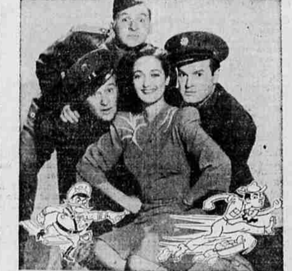
Bob Hope and Dorothy Lamour, who with Eddie Bracken and Lynne Overman, head the cast of funsters in "Caught in the Draft," tomorrow at the Pine Tree. Norma Shearer and Bob Taylor are starred in the co-hit, "Her Cardboard Lover."