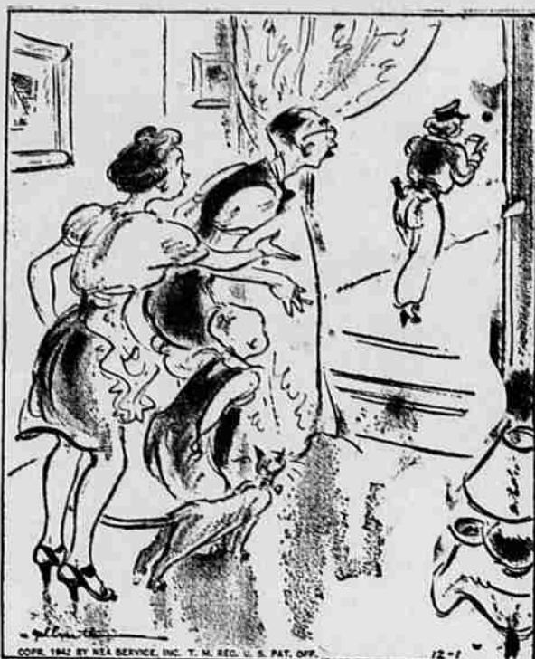
"Now you'll just have to clean up that cellar! With a man meter inspector it was different, but I'm not going to have a woman seeing any part of my house that dirty!"